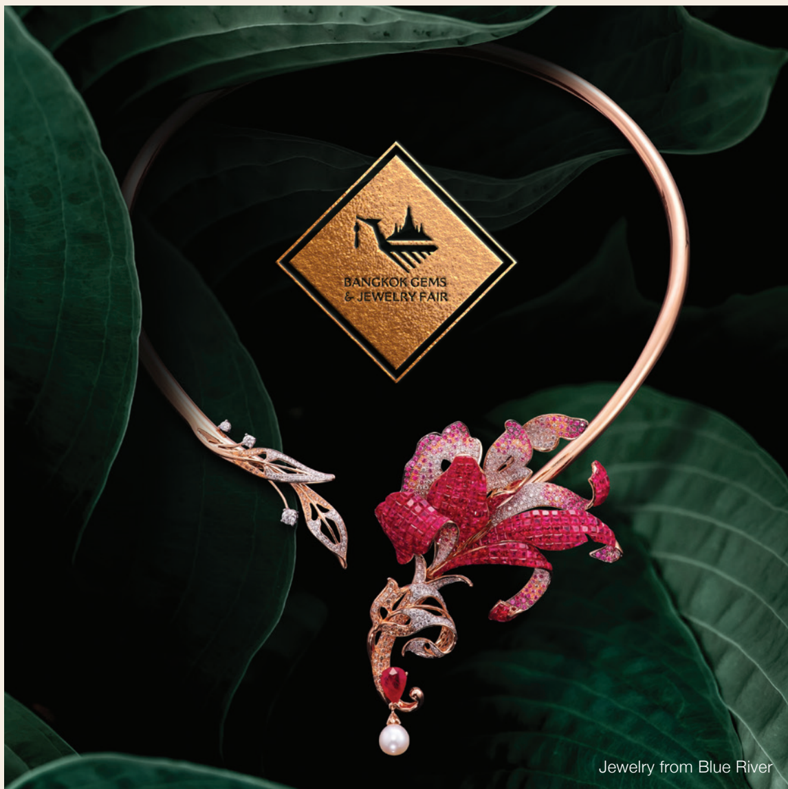
Jewelry from Blue River

Bangkok beckons as the 69 th Bangkok Gems and Jewelry Fair hosts its coveted Networking Reception, a highlight for exhibitors and buyers alike. Set for February 21, 2024, at the QSNCC's Plenary Hall on level 1, doors open at 17:30 hrs. to an evening of opportunity under the theme "Cultivating Connections." This special event is designed to